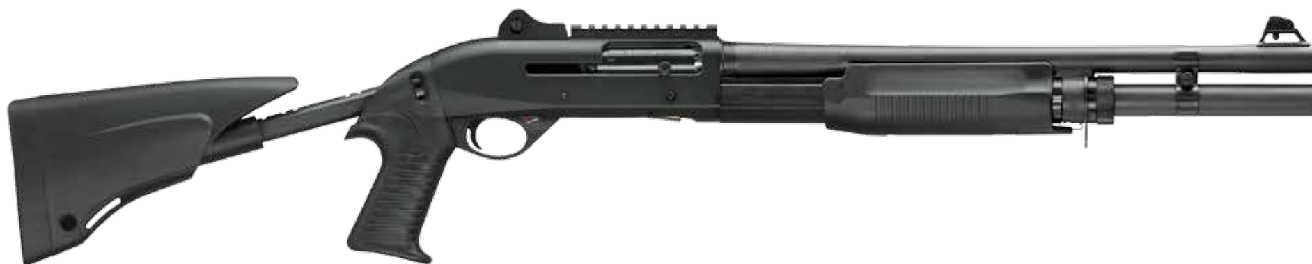
14"+ DOOR-BREACHER TELESCOPIC STOCK