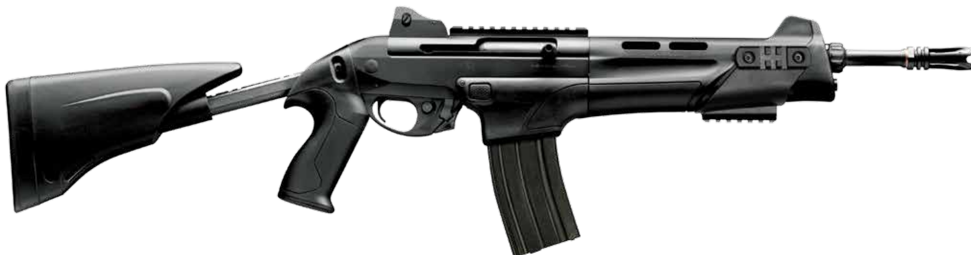
12,5"+2" TELESCOPIC STOCK