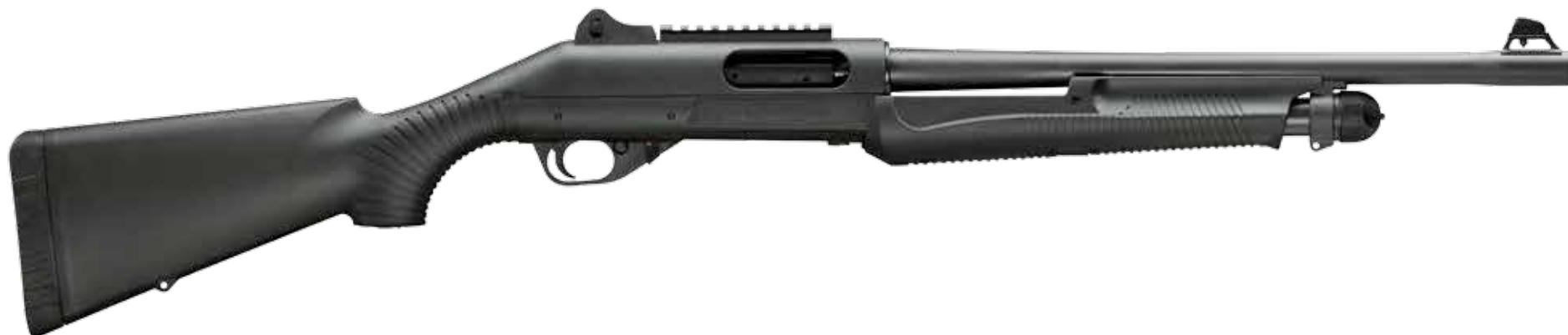
14"+ DOOR-BREACHER MONOBLOCK STOCK/RECEIVER