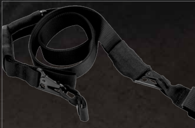
3 POINTS SHOTGUN STRAP