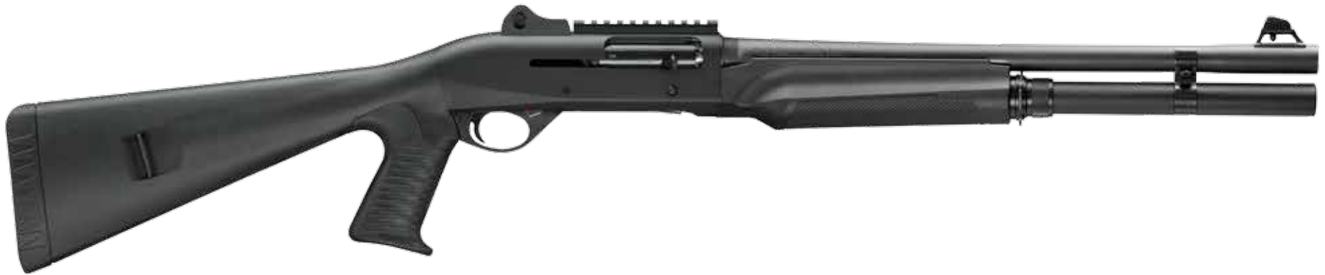
14"+ DOOR-BREACHER PISTOL GRIP STOCK