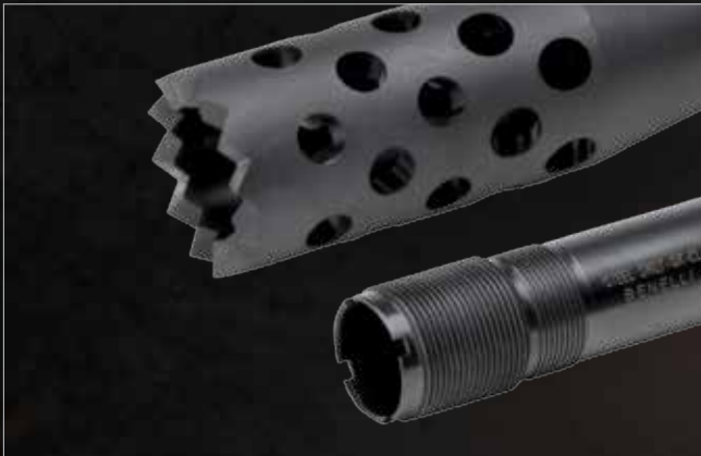
DOOR-BREACHER AND CHOKE