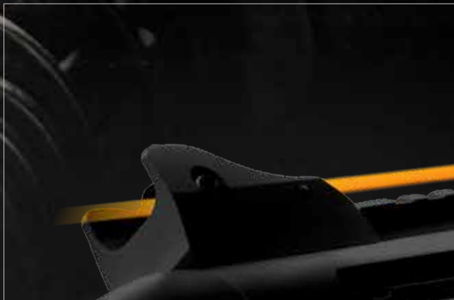
GHOST RING SIGHT